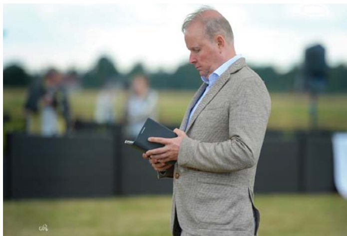
Judge James Swaenepoel (Belgium)