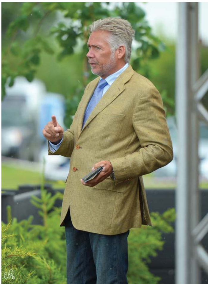
Judge Klaus Beste (Germany)

Many participants upon departure expressed their hope that the show would be continued. Definitely its location is very favorable and the organizer’s involvement gives reason to believe that we met in Radom not for the last time. 🐾